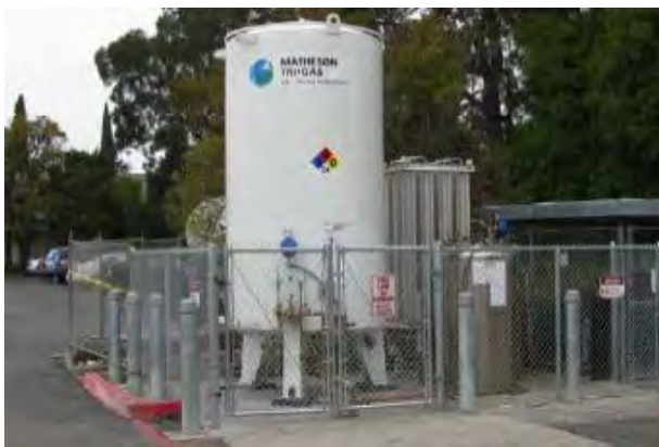
Fenced cryogenic tank setup on hospital grounds