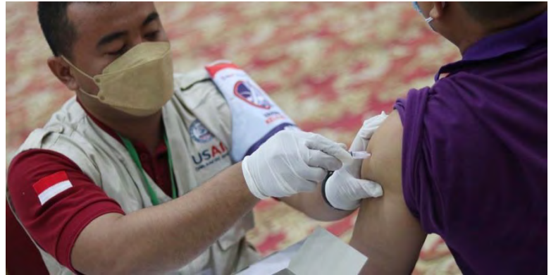
EpiC mobilized over 3,200 private sector doctors, nurses, and midwives as vaccinators to administer over 1.74 million doses between August 2021 and April 2022.

EpiC supports COVID-19 vaccine readiness and rollout in 24 countries: Botswana, Cameroon, Djibouti, Dominican Republic, El Salvador, Eswatini, Guatemala, Haiti, Indonesia, Kazakhstan, Lesotho, Liberia, Maldives, Mali, five Pacific Island nations (Fiji, Tonga, Kiribati, the Solomon Islands, and the Marshall Islands), Nepal, Nigeria, Papua New Guinea, Tanzania, and Uganda. The project partners work with national stakeholders to jointly develop and roll out COVID-19 vaccination policies and plans, prepare frontline health workers to deliver COVID-19 vaccines, track adverse effects, and develop monitoring systems to improve vaccine delivery. To create demand, counter misinformation, and address vaccine hesitancy, EpiC leads vaccine communication campaigns and engages trusted local leaders and peers in sharing accurate information about the safety and benefits of COVID-19 vaccinations.