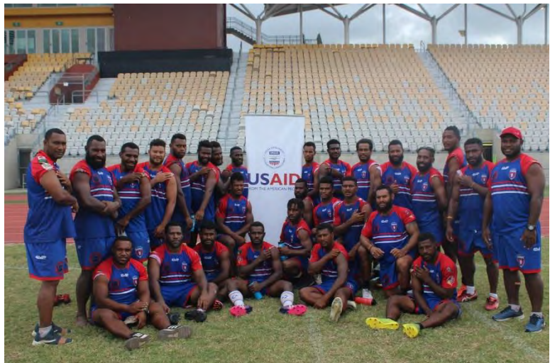
Central Dabaris rugby players and coaching staff after receiving their COVID-19 vaccinations.

Examples: In Tanzania , EpiC partnered with USAID's Tulonge Afya project to increase demand for COVID-19 vaccination through mass media outreach and community mobilization, reaching over 37 million Tanzanians with vaccine promoting messages. In Papua New Guinea , EpiC partnered with Sogeri Health Centre to conduct extensive community engagement and COVID-19 vaccine awareness activities, including holding an event to publicly vaccinate players on the Central Dabaris, a popular premier rugby league club, who became vaccine champions.