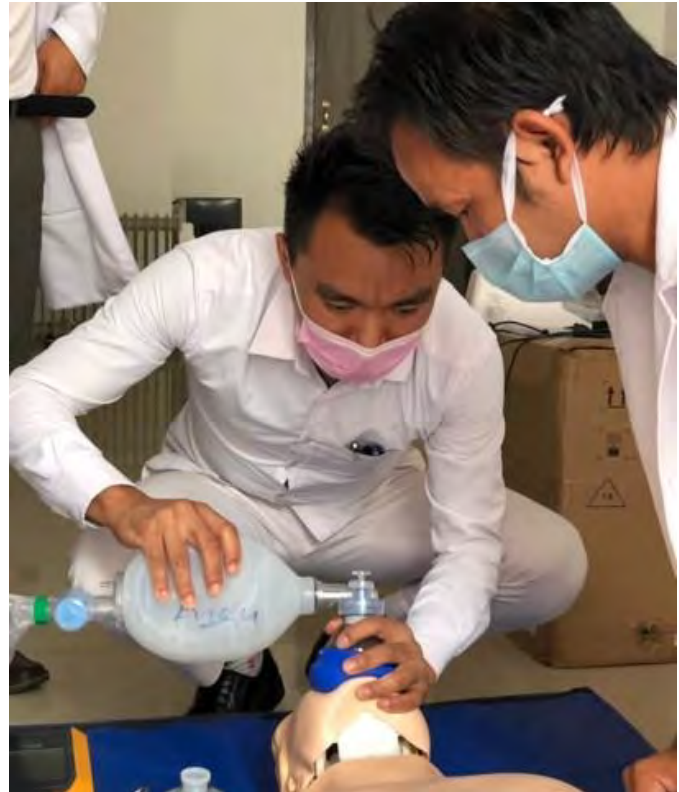
Health care workers receive training in critical care in Bhutan.

Examples: In Nigeria , EpiC partnered with the Federal Ministry of Health to build the capacity of 1,070 health care workers in COVID-19 case management and critical care through training, clinical mentoring, and establishment of a community of practice for COVID-19 care. EpiC El Salvador opened three hands-on