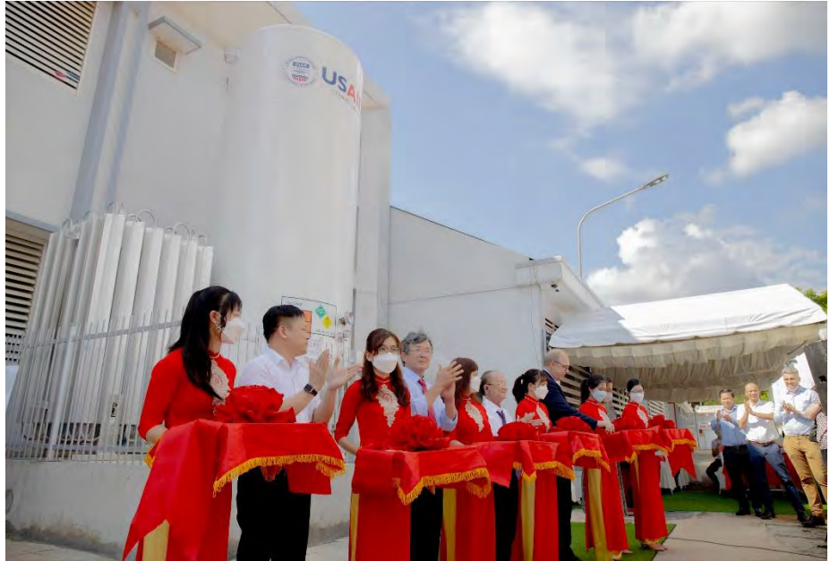
The first USAID-funded liquid oxygen system is inaugurated at the Tan Bien District Health Center in Vietnam.

Examples: In Vietnam , EpiC is procuring and installing LOX systems at 13 high-demand facilities, including a cryogenic LOX storage tank, a vaporizer, safety regulators, and a piping system linked to up to 80 beds per facility. EpiC is also training