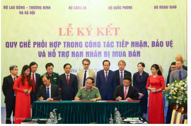
Ministers signed the Inter-ministerial Coordination Vice Framework on Victim Support in Hanoi on July 18th, 2022.

In May 2022, EpiC supported the GVN to complete a legal framework review and develop an impact assessment of victim support policies with recommendations for revision to the Law on Human Trafficking. EpiC also collaborated with the government to develop a national framework on human trafficking that clarifies how ministries and respective provincial departments can optimize victim support including recovery, referral, and reintegration. The framework was signed by four relevant ministries in July 2022. Just over one year after its signature, 41 provinces had established their own provincial coordination regulations (November 2023). However, to date, little is known of how effectively the provincial frameworks have improved the coordination of victim support. In 2024, EpiC will support the GVN to assess the framework application at the national and provincial levels, identify gaps, and develop joint action plans to optimize victim support. The project will collaborate with MOLISA to co-host a national workshop to share the results and lessons learned.