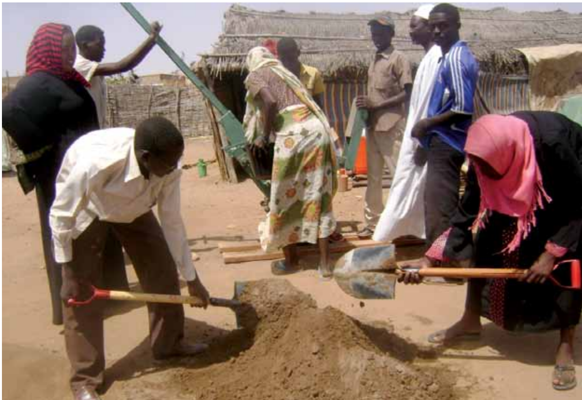
Darfur NGO-led Soil Stabilization Bricks construction training in Domaya town, South Darfur.