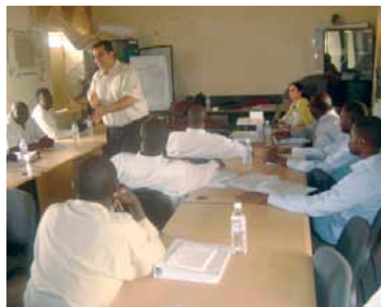
Top: El Fasher Peace Center Library Bottom: Training with Salam Institute