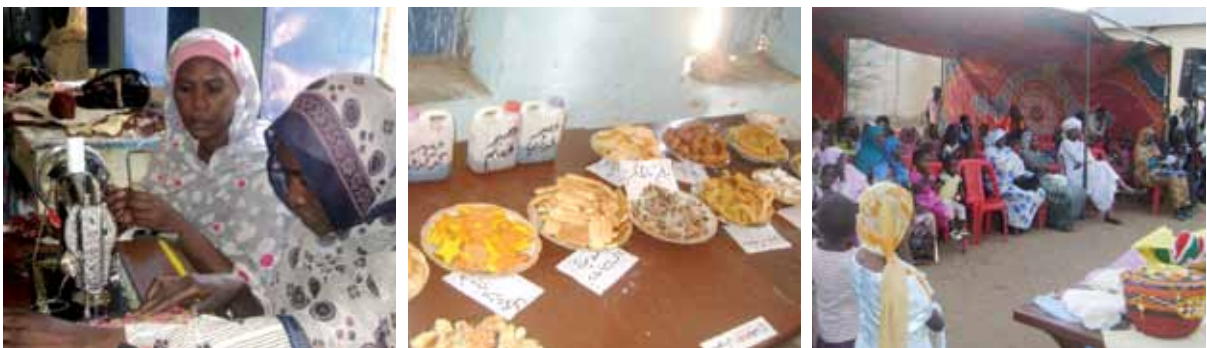
Mothers' Council members: sewing training; food processing products; awareness-raising campaign with community members on the importance of girls' education.

In 2010, DCSP launched a small pilot project, founding and supporting women-only PTAs called Mothers' Councils. The Mothers' Councils were trained in community consultation and designed and implemented projects that provided training and supplies for valuable livelihood skills (sewing and food processing) for 73 women and secondary school graduates from eight schools . The products